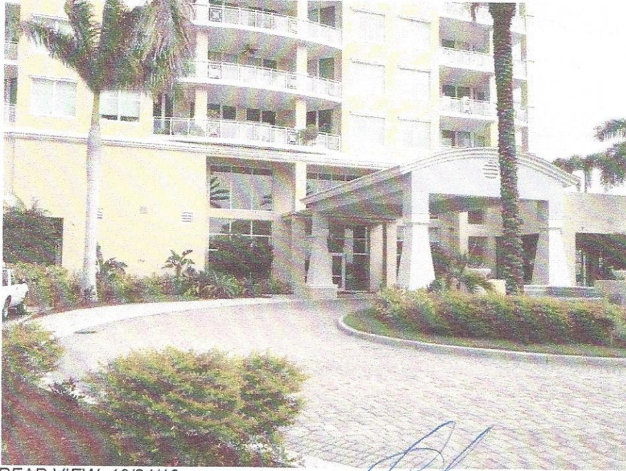
REAR VIEW 10/24/13